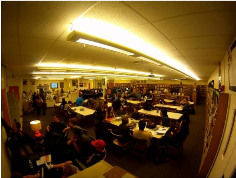
HBHS Library (student created)