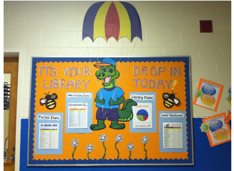
from The Adventures of Library Girl