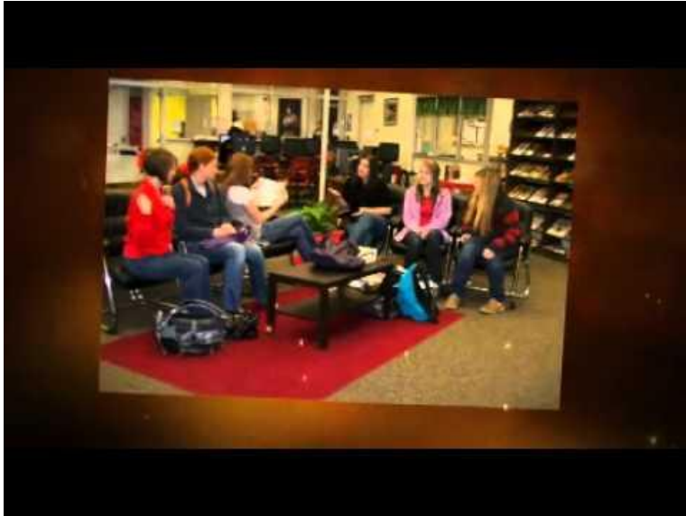
Anderson One Library (created with Animoto)