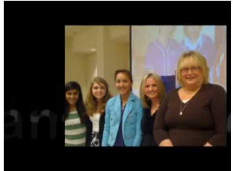
The Unquiet Library annual report using Animoto