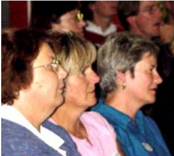
A captivated audience at the SLANZA Wellington meeting at Karori West Normal School Library

This was a very popular meeting, attended by a large number of library and IT staff from around the Wellington region, some travelling quite long distances to get there. We left the meeting inspired and very impressed by what Karori West has achieved.